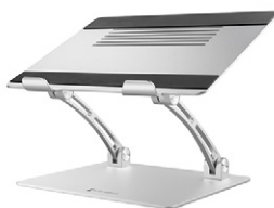
Adjustable Laptop Stand (PS0106EA1STA)