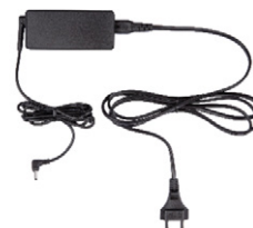
Travel Adapter (PA5272U-3PRP)