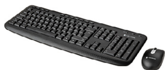
Wireless Keyboard and Silent Mouse Combo (PA5350E-1ETE)